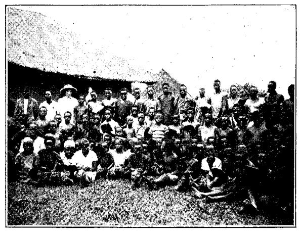
A School in a Heathen Town

Coming home from a prayer-meeting one night I said to one of the men, "How are your women now? They used to give you so much trouble. Do they give you trouble now?" "Oh no" he said, "since our women got saved they